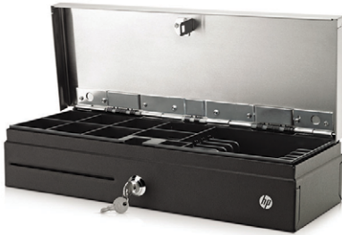
HP Retail Solutions HP Flip Top Cash Drawer