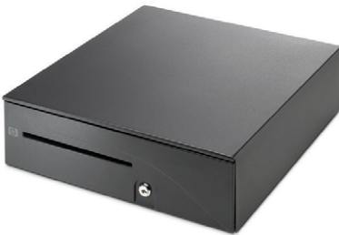
HP Retail Solutions HP Heavy Duty Cash Drawer