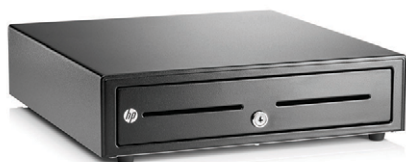
HP Retail Solutions HP Standard Duty Cash Drawer